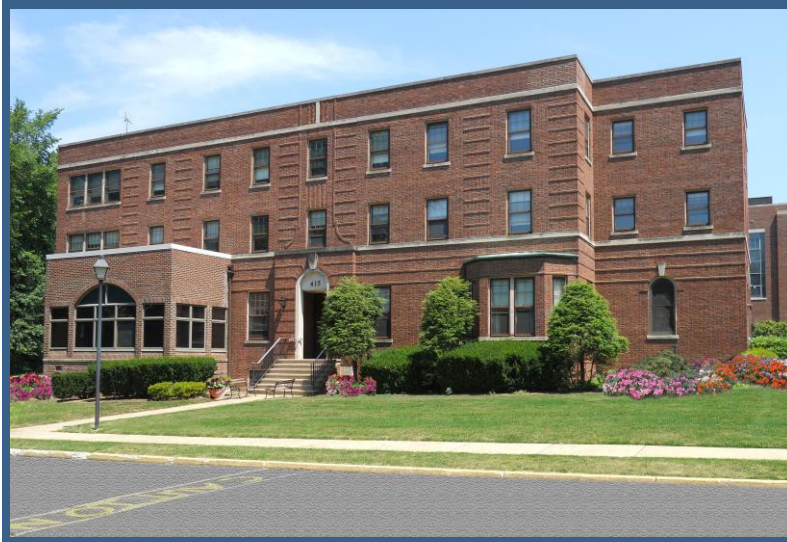
The Senior Residence at St. Peter the Apostle